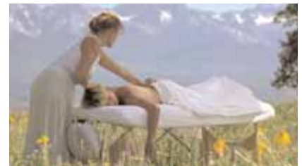
The Chipeta Sun Lodge and Spa in Ridgway smooths away the rigors of the road with a massage.

On the short (and mercifully flat) drive from Ouray to Ridgway, Orvis Hot Springs tempts the weary with a soak in the natural steaming lithium pools. The springs are clothing-optional, and while some guests don swimsuits, most wear nothing but an air of assumed nonchalance. (The outdoor pools aren’t visible from the nearby road, and the staff stays on alert for staring or other inappropriate behavior.) More soothing awaits at the Chipeta Sun Lodge and