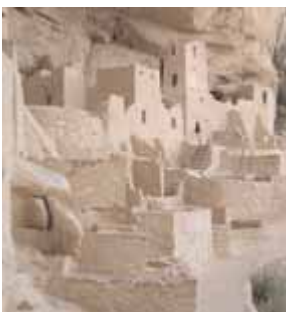
The sites and sights of Mesa Verde reveal the world of the Ancestral Puebloans.

Even city slickers relax on this drive through Wild West country. The journey begins at massive Mesa Verde, continuing east and north on quiet roads past undulating hills, fields of tiny wildflowers, and the occasional brown-velvet deer. Ice climbing, mountain jeep tours, and hiking introduce travelers to the lush but demanding landscape, while lazy soaks in the area's natural hot springs soothe sore muscles.