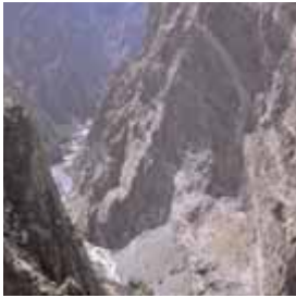
Sunlight seldom reaches the depths of the Black Canyon of the Gunnison outside Montrose.

coyote pins and eagle belt buckles. The prices range from souvenir-cheap to special-occasion-splurge. A simple silver bracelet with a pleasing asymmetrical curve costs about $35.