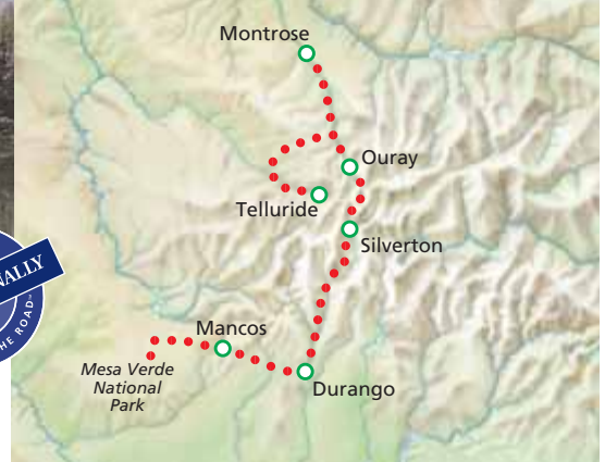
For a full map of Colorado, see pp. 19-21 of the Rand McNally 2006 Road Atlas.