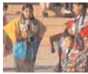
Native American dancers awe visitors to the cultural center in Cortez.