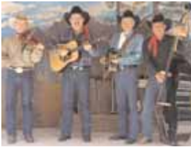
The Bar D Wranglers have entertained visitors to Durango since 1969.

singing cowboy show follows a chuck wagon dinner of barbecue, homemade biscuits, and baked beans. Between songs, the Bar D Wranglers tell “Western fairy tales” — instead of “Once upon a time,” they start with “Y’all ain’t never gonna believe this!” An after-dinner option: the Diamond Circle Melodrama and Vaudeville .