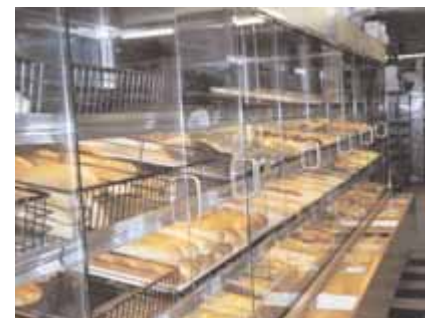
Self-serve breads and pastries line the wall at Baked in Telluride.

Back in town, treats line the wall o’ pastries at Baked in Telluride — a banana streusel muffin, maybe, or a thickly frosted chocolate cupcake. Diners with not-so-sweet-teeth can order from the café’s extensive menu, which offers everything from pizza to potato knishes. Afterwards, shoppers can stroll to Hell Bent Leather and Silver. This shop’s graceful bracelets, necklaces, and other baubles prove that Southwestern jewelry isn’t all