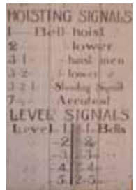
A weathered sign at Telluride Historical Museum recalls the town’s days as a mining community.

The next stop, a slight backtrack, is Telluride, a small community with a wealth of attractions. During the winter, the town becomes a haven for skiers, snowboarders, and other cold-weather enthusiasts. But it has plenty to offer no matter the season. Peek into its past at the Telluride Historical Museum, originally built as a hospital for the miners in the area. The “Hardship and Healthcare” room is especially poignant. The large coffin-shaped wicker basket on display was once used to carry the injured or ailing to the hospital. Dave’s Mountain Tours takes riders on 4x4 excursions to the remains of the once-thriving Tomboy Mine (among other destinations). In good weather, the driver folds the windshield down so no one misses a glimpse of the ghost towns and other ruins that stud the landscape.