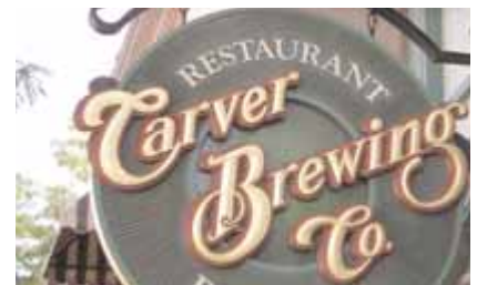
Even non-drinkers value this Durango brew pub for its rich, dark root beer.

Herbs, a small, aromatic shop offering its own line of medicinal teas, essential oils, salves, and body care products. The staff can advise customers on herbal tinctures for nearly any ailment, from bleeding gums to insomnia. Down the street, Carver Brewing Company makes its own microbrews along with an excellent dark root beer. The pub also offers hearty food of the chicken-stew-and-mashed-potatoes ilk. An easy 15-minute drive out of town leads to the Bar D, where a