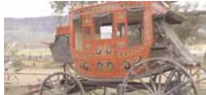
Mancos Valley Stage's shiny red coach sets the mood for a trip to the Old West.

In nearby Mancos, Bartels' Mancos Valley Stage Line shows a different side of the Old West. In the 1800s, passengers paid $200 to ride a stagecoach 18 hours a day, 24 days straight. These days the ride costs a lot less, lunch or dinner is available, and there aren't