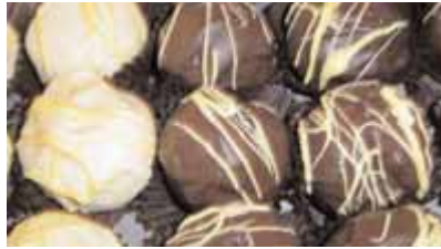
Handmade truffles are drizzled with ribbons of lemon at Mouse’s Chocolates in Ouray.

Even locals admit that the drive from Silverton to Ouray is lovely but treacherous. The winding, steep mountain road, known as the “Million Dollar Highway” for the gold and silver ore once transported on it, makes caution a must, especially in the