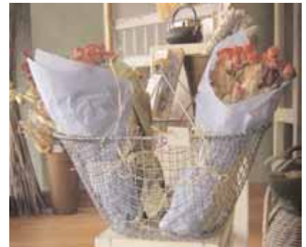
Both dried flowers and more medicinal offerings await at Dancing Willow Herbs in Durango.

Herbs, a small, aromatic shop offering its own line of medicinal teas, essential oils, salves, and body care products. The staff can advise customers on herbal tinctures for nearly any ailment, from bleeding gums to insomnia. Down the street, Carver Brewing Company makes its own microbrews along with an excellent dark root beer. The pub also offers hearty food of the chicken-stew-and-mashed-potatoes ilk. An easy 15-minute drive out of town leads to the Bar D, where a